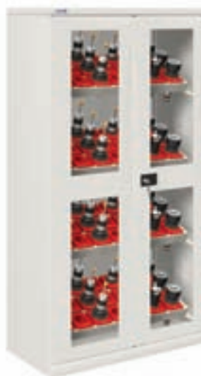
Size: Art. Nr. 1026x555x2000 mm 24-62000-40 Fittings: 4 Fixed tool holders frames 3-rows 4 Frame supports, angled