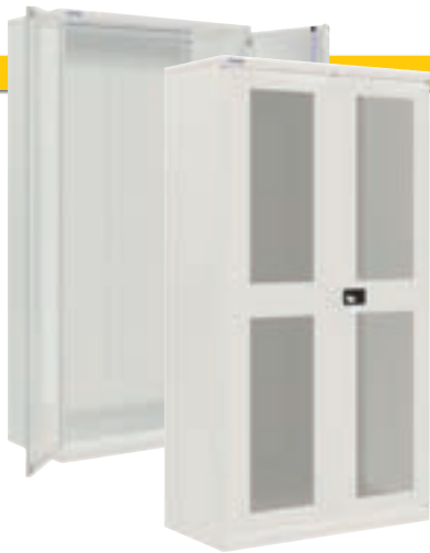
Cabinet housings with leaf door

Made of high-quality sheet steel. Housing sides and bases are painted with high resistance products, environmentally friendly. Available in one height only with sides slotted in increments of 25 mm to allow drawers, shelves and tool holder frames to be adjusted accordingly. Doors are fitted with safety cylinder lock and 2 keys and can be standard or in Plexiglas®.