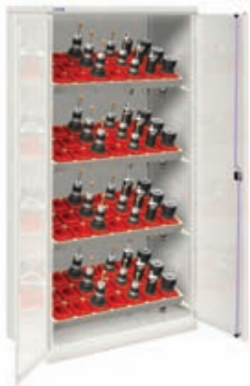
Size: Art. Nr. 1026x555x2000 mm 24-32000-40 Fittings: 4 Fixed tool holders frames 3-rows 4 Frame supports, angled