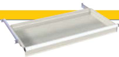
Drawers Made of high quality steel