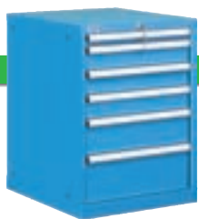
Cabinet housings see page 210