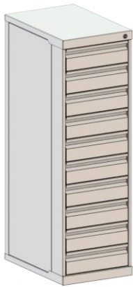
430mm WIDE CABINET